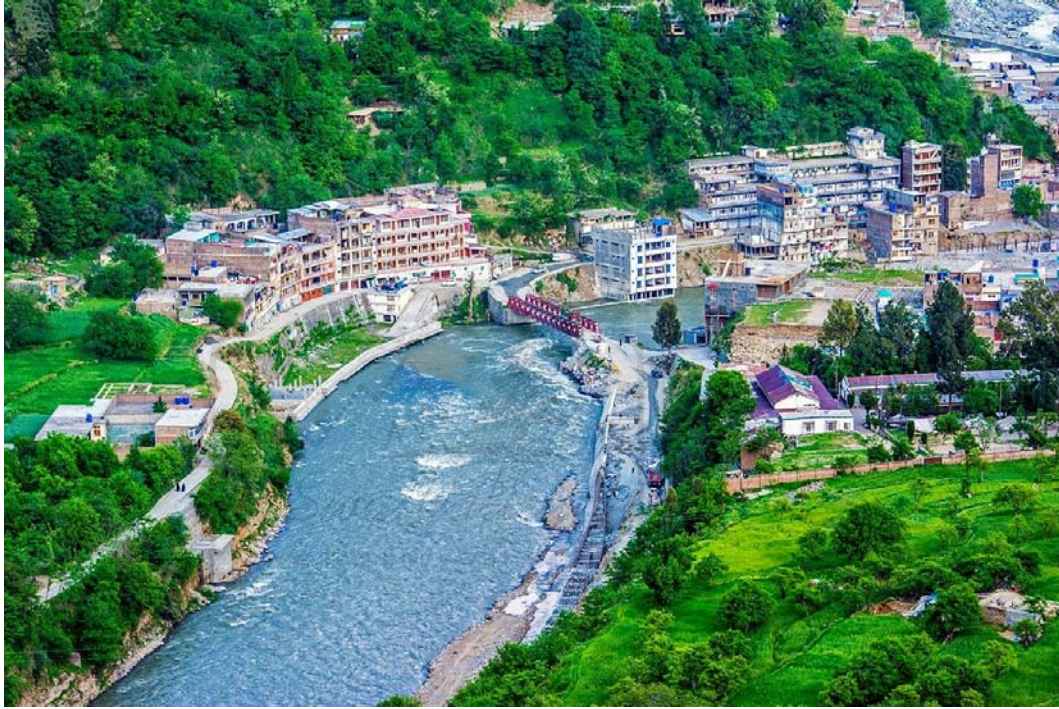
Swat Valley, Pakistan