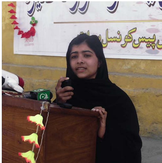
Malala

I had a terrible dream yesterday with military helicopters and the Taliban. I have had such dreams since the launch of the military operation in Swat. My mother made me breakfast and I went off to school. I was afraid going to school because the Taliban had issued an edict banning all girls from attending schools... On my way from school to home I heard a man saying 'I will kill you'. I hastened my pace and after a while I looked back if the man was still coming behind me. But to my utter relief he was talking on his mobile and must have been threatening someone else over the phone.