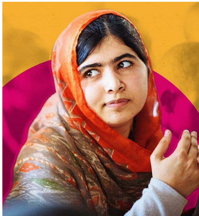
Malala

The film described the evacuation of Malala’s town as the Talban advanced. It showed Malala appealing to U.S. Special Envoy, Ambassador Richard Holbrook, to Afghanistan and Pakistan to help restore education in their valley. The family had to leave for fear of being killed by the Taliban.