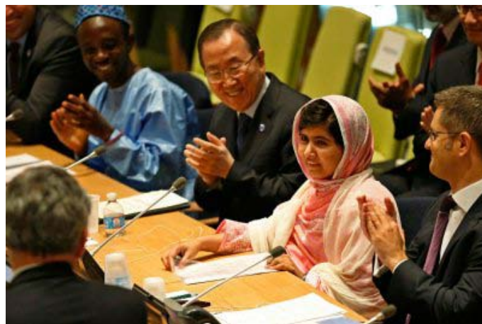
12 July 2013: Malala Yousafzai is introduced before her speech at the United Nations Headquarters in New York

The President of Pakistan called the shooting an attack on “civilized people.” President Barack Obama said it was “reprehensible, disgusting and tragic.” Secretary of State Hillary Clinton applauded Malala her bravery and standing up for the rights of girls. 14 Celebrities devoted songs to Malala’s courage and a fund was started in her name to help the education of girls. The Taliban were not repentant, despite the worldwide condemnation of their action. “‘We warned him (Malala’s father) several times to stop his daughter from using dirty language against us, but he didn’t listen and forced us to take this extreme step.’ The Taliban also justified its attack as part of religious scripture, stating that the Quran says that ‘people propagating against Islam and Islamic forces would be killed’, going on to say that ‘Sharia says that even a child can be killed if he is propagating against Islam.’” 15 While some suspected Taliban were brought to justice, doubts remained as to whether or not Malala’s attacker was ever found. 16