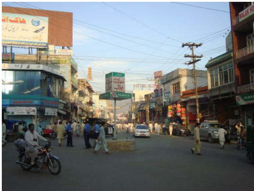
Mingora Square

It was the Taliban's anti-woman agenda, however, that caused mounting concern around the world. Under the Taliban women were forbidden to work outside the home, were compelled to wear a head-to-toe covering known as a burka, and could not leave the home without a male guardian. Such issues, along with restrictions on women's access to health and education, caused resentments among ordinary Afghans and drew the ire of the international community. To the Taliban, however, the restrictions served to preserve the honor and dignity of women who had previously been preyed upon.