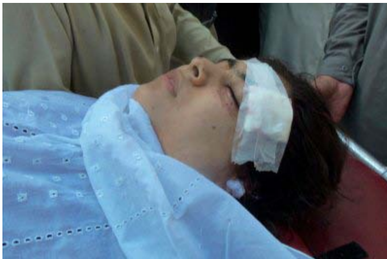
Malala on her way to the hospital, October 9 th, 2012

Malala was now well known around the world. She spent the next two years completing her education as best she could and giving speeches and interviews to support education of girls. In 2011, she was awarded the International Children's Peace Prize, the National Youth Peace Prize. As her fame grew, so did the peril facing her; she received death threats in many forms: from papers being slipped under her door to warnings via social media. The Taliban were determined to silence her. 9