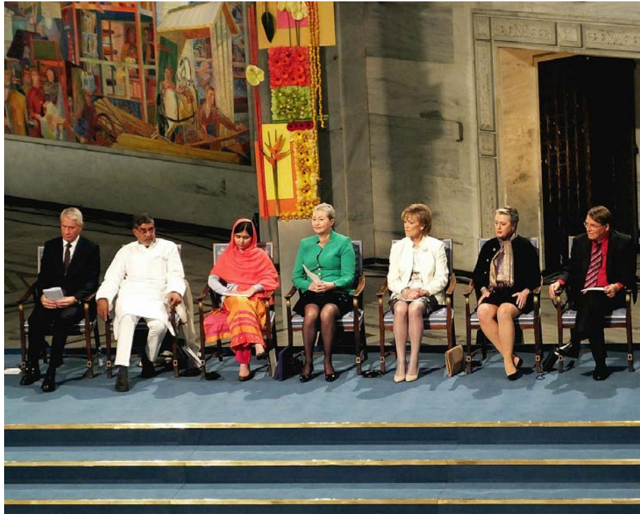
Malala and Kaliash Satyarthi, who also won the Peace Prize at the Nobel Peace Prize ceremony in Oslo Dec. 19 2014

“‘The terrorists tried to stop us,’ she said. ‘Neither their ideas nor their bullets could win. We survived. And since that day, our voices have grown louder and louder. I tell my story not because it is unique but because it is not,’ she said. ‘It is the story of many girls. Today, I tell their stories too. I have brought with me some of my sisters from Pakistan, from Nigeria, and from Syria who share this story. This award is not just for me. It is for those forgotten children who want education,’ Malala said. ‘It is for those frightened children who want peace. It is for those voiceless children who want change. I am here to stand up for their rights, to raise their voice. It is not time to pity them.’” 18