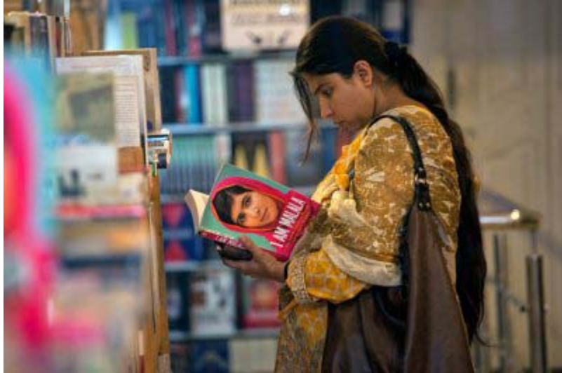
A woman reads a copy of Malala's book " I am Malala " in Islamabad, Pakistan

border. The institution provided education of Syrian refugees and, in particular, training and learning for girls ages 14 to 18. Malala called on world leaders to invest in “books, not bullets.” 19