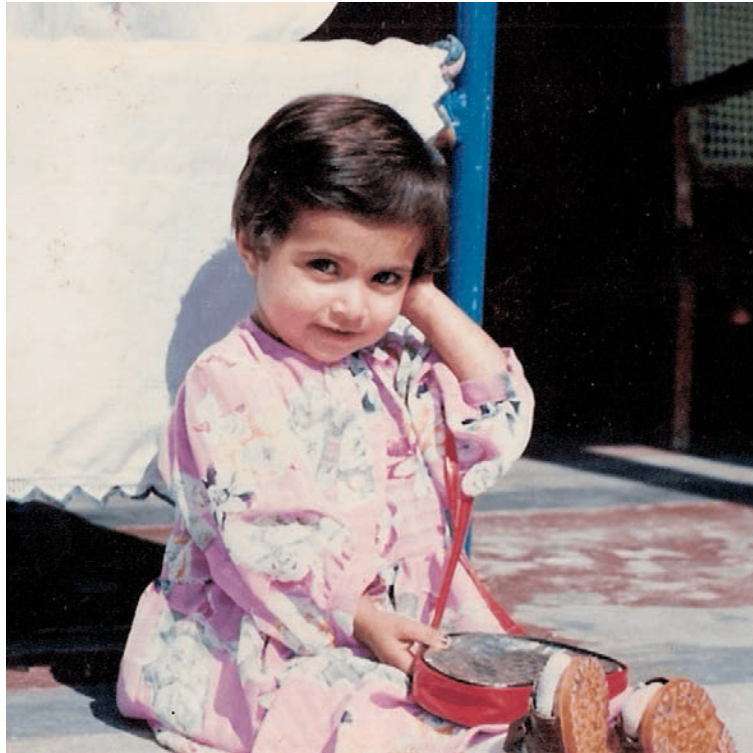
Malala as a baby

She was born on July 12 th 1997. Her father named her after a Pashtun heroine. Pashtuns was among the oldest traditional Islamic cultures dating back to Alexander the Great known for its rich history, music, poetry, colorful language and beautiful clothing. The Pashtun traditions were respected in Malala's family; she would wear a head scarf but did not cover her face. This was something that made her unique. This uniqueness of Malala's character was reflected in her everyday life including her love of learning. Malala's mother was different because as she was illiterate, she could not understand the fervor Malala and her father had toward education.