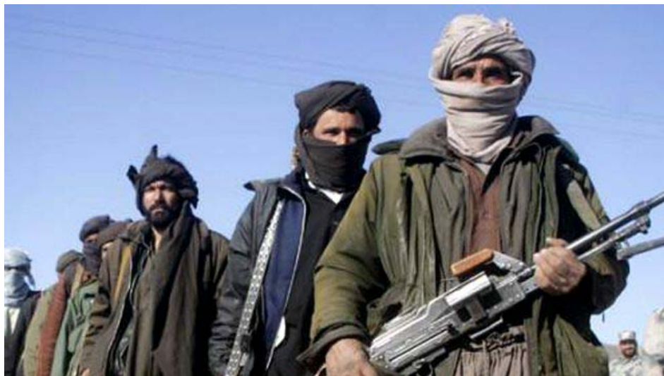
Taliban Fighters

The International Encyclopedia of Social Sciences provided an article about the Taliban and their philosophy: 2